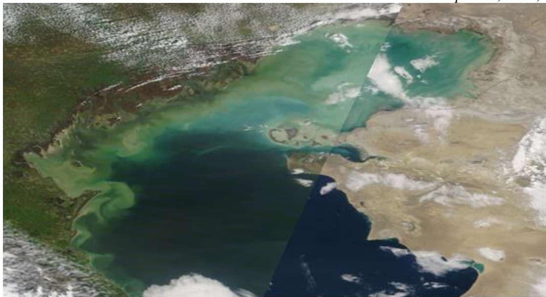
Fig.1 Space image of the Caspian Sea, April 02, 2026