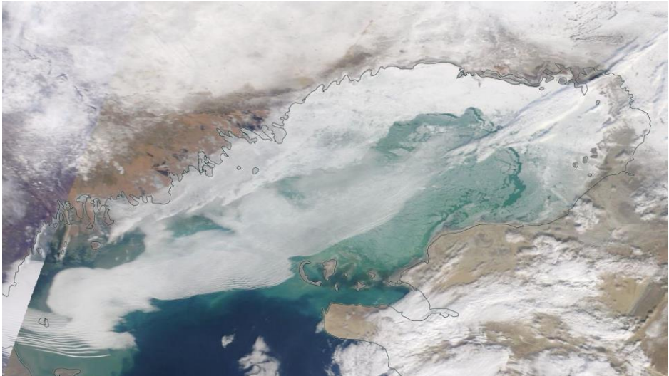
Fig 1. Ice conditions on the Caspian Sea, 31, January, 2022. Image of the «MODIS Project at NASA Aqua»