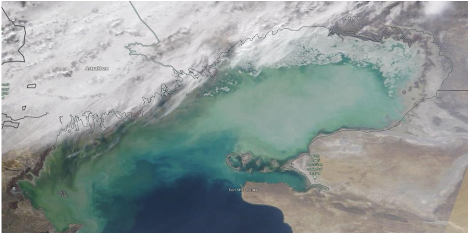
Fig 1. Ice conditions on the Caspian Sea, 20 February, 2022.