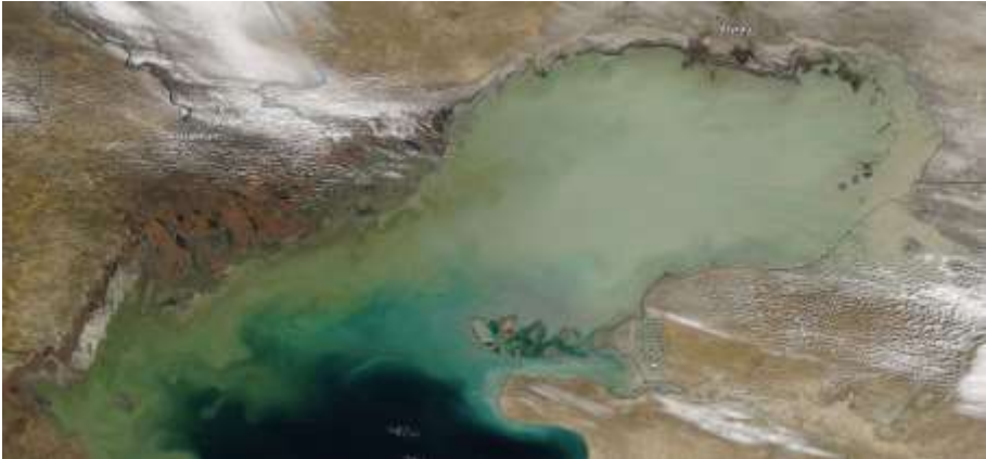
Fig.1 Space images of the Caspian Sea, 07 March, 2022