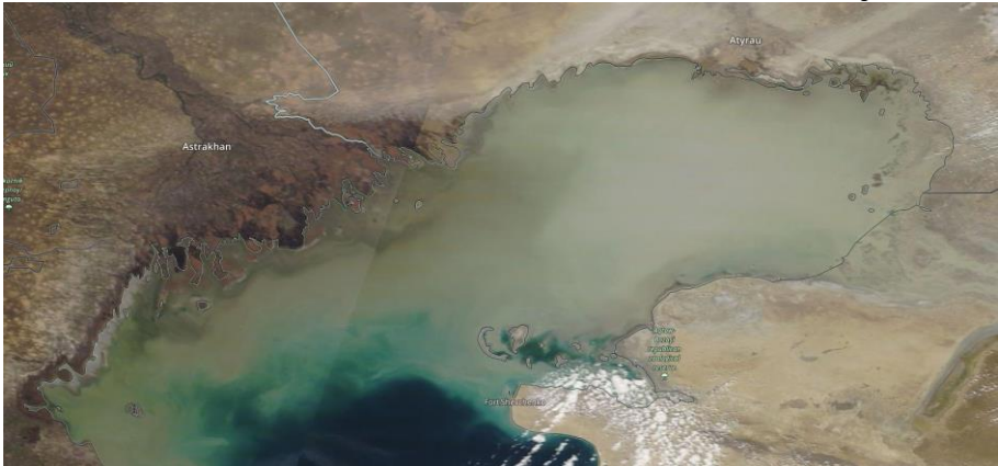
Fig.1 Space images of the Caspian Sea, 29 March, 2022, NAGA/GSFC