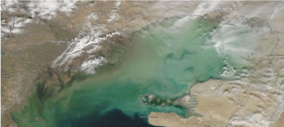
Fig.1 Space images of the Caspian Sea, 03 April, 2022