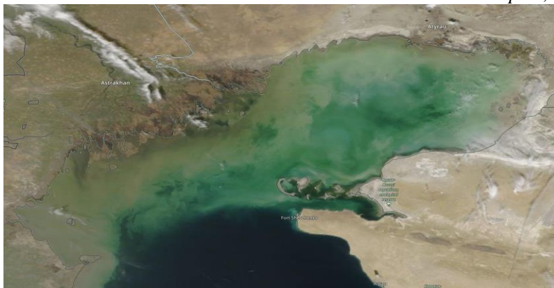
Fig.1 Space images of the Caspian Sea, 19 April, 2022