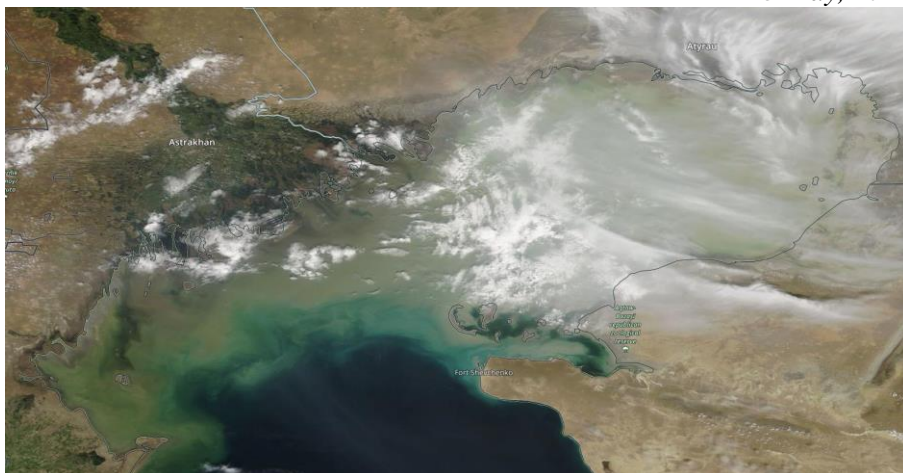
Fig.1 Space images of the Caspian Sea, 10 May, 2022