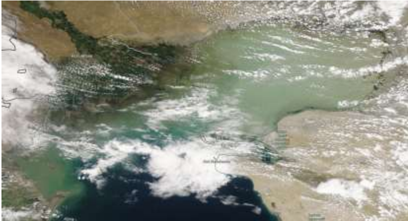
Fig.1 Space images of the Caspian Sea, 21 May, 2022