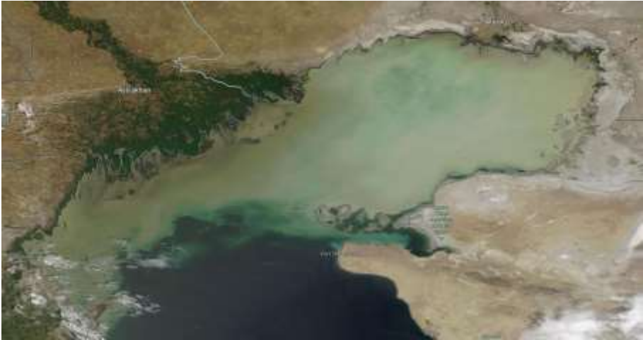
Fig.1 Space images of the Caspian Sea, 14 June, 2022,NAGA/GSFC