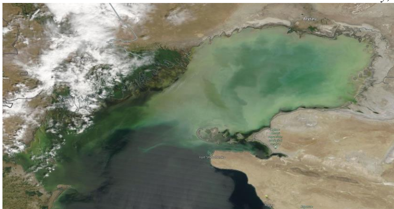
Fig.1 Space images of the Caspian Sea, 18 July, 2022