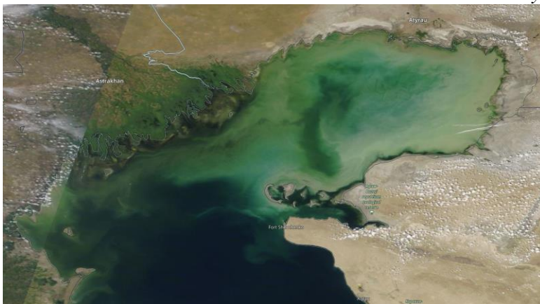
Fig.1 Space images of the Caspian Sea, 26 July, 2022