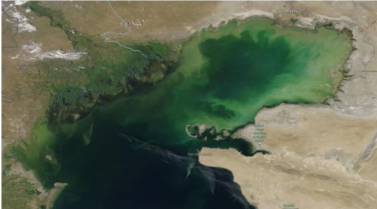
Fig.1 Space images of the Caspian Sea, 02 August, 2022