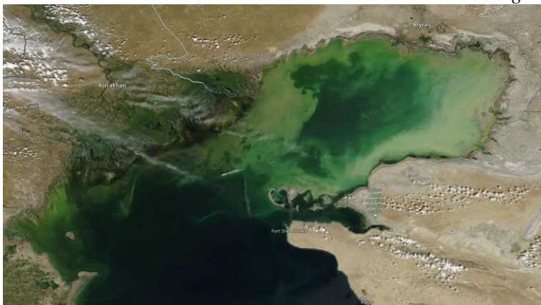
Fig.1 Space images of the Caspian Sea, 05 August, 2022