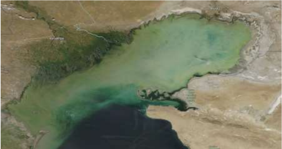
Fig.1 Space images of the Caspian Sea, 21 August, 2022