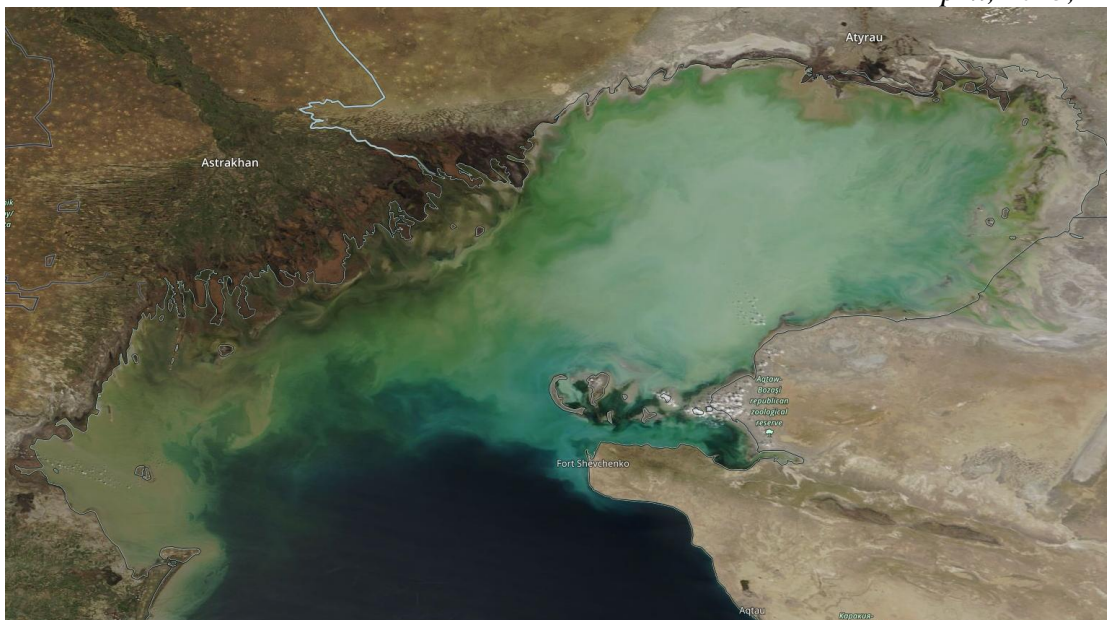
Fig.1 NAGA/GSFC space images of the Caspian Sea, April 18, 2023

In the period the sea level is expected to fluctuate around the mark of minus 28.41m BS. The range of fluctuations in sea level is from minus 27.86m to minus 28.89m.