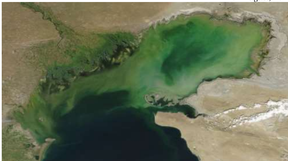
Fig.1 NAGA/GSFC space images of the Caspian Sea, August, 02, 2023

In the period the sea level is expected to fluctuate around the mark of minus 28.79 m BS. The range of fluctuations in sea level is from minus 28.48 m to minus 29.26 m.