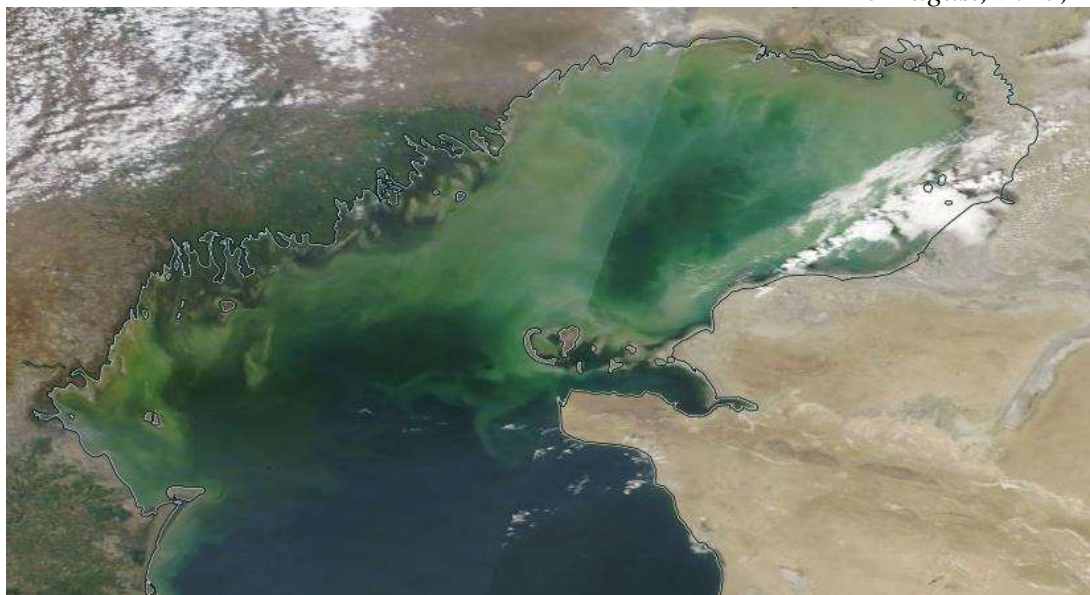
Fig.1 NAGA/GSFC space images of the Caspian Sea, August, 23, 2023

In the period the sea level is expected to fluctuate around the mark of minus 28.79 m BS. The range of fluctuations in sea level is from minus 28.53 m to minus 29.23 m.