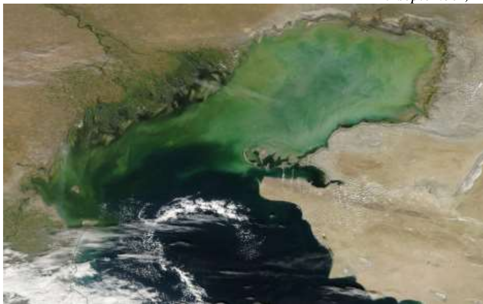
Fig.1 NASA/GSFC space images of the Caspian Sea, September 14, 2023

In the period the sea level is expected to fluctuate around the mark of minus 28.79 m BS. The range of fluctuations in sea level is from minus 28.45 m to minus 29.33 m.