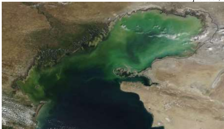
Fig.1 NASA/GSFC space images of the Caspian Sea, September 20, 2023

In the period the sea level is expected to fluctuate around the mark of minus 28.82 m BS. The range of fluctuations in sea level is from minus 28.40 m to minus 29.31 m.