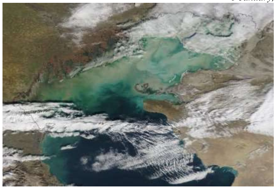
Fig. 1 NASA/GSFC space images of the Caspian Sea, January, 1, 2024