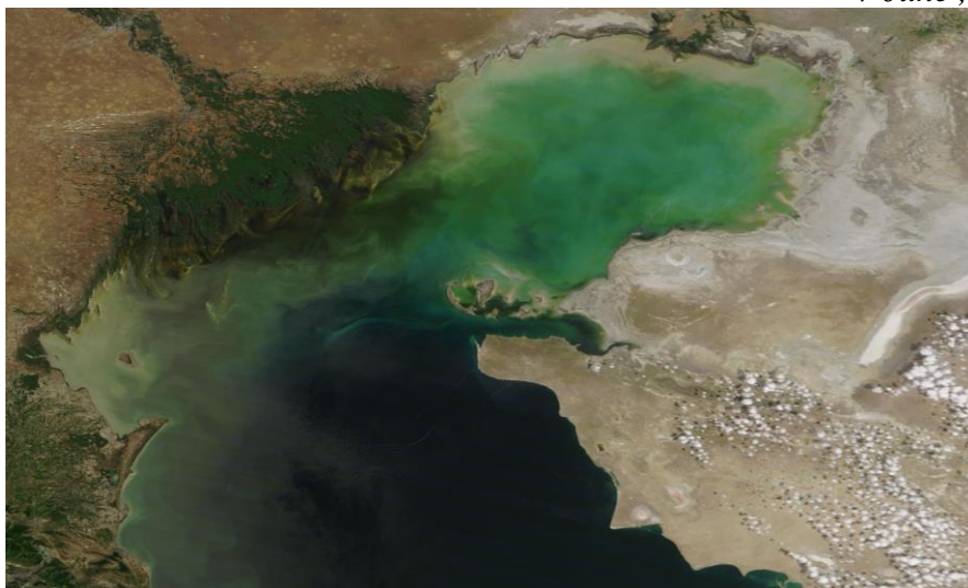
Fig.1 NASA/GSFC space images of the Caspian Sea, June 5, 2024