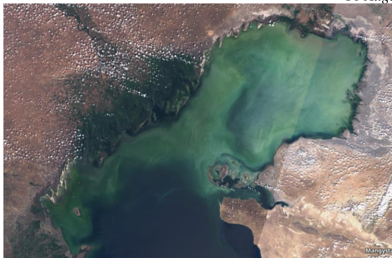
Fig.1 Space image of the Caspian Sea, August 15, 2024 (Sentinel-3 OLCI)