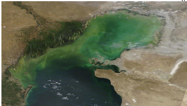
Fig.1 NASA/GSFC space images of the Caspian Sea, August 22, 2024