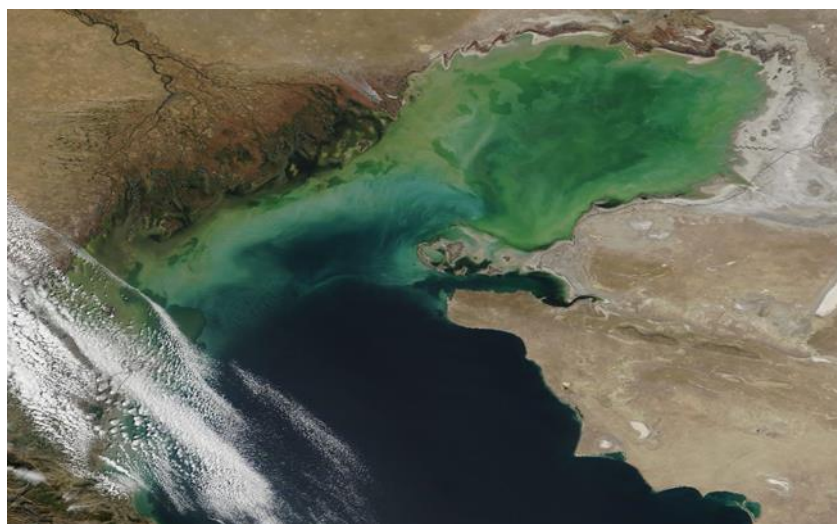
Fig.1 Space image of the Caspian Sea, October 10, 2024