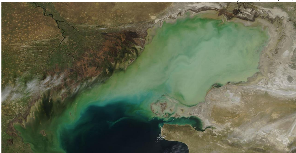
Fig.1 Space image of the Caspian Sea, April 17, 2025

In the period on April 17 – 22, the sea level is expected to fluctuate around the mark of minus 29.43 m BS. The range of fluctuations in sea level is from minus 29.05 m to minus 29.72 m.