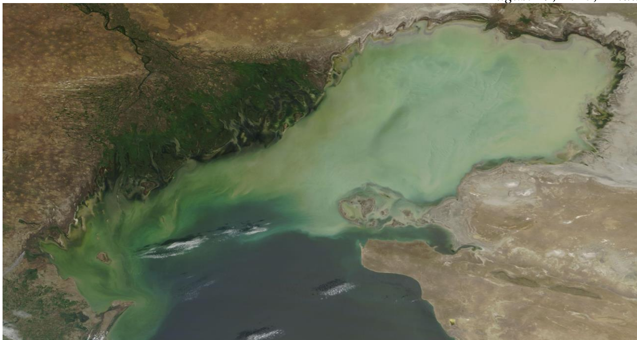
Fig.1 Space image of the Caspian Sea, August 27, 2025 (NASA/GSFC)

In the period on August 28 – September 02, the sea level is expected to fluctuate around the mark of minus 29.46 m BS. The range of fluctuations in sea level is from minus 29.03 m to minus 29.77 m.